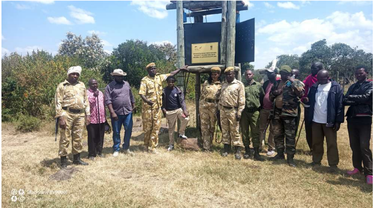
Figure 1: A team led by Oloisukut Conservancy manager and Trans Mara Kenya Wildlife Service warden and host of community leaders during a site inspection to establish the electric fence deficiencies at Oloonkolin Area.